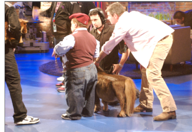
She really is that small...