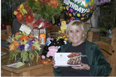
Flowers, chocolates, cookies.