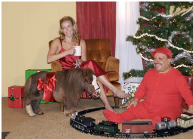
Thumby, Chelsea Handler & Chuy